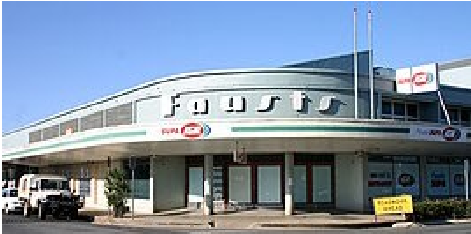
Opening of Faust's Shop after rebuild in 1963