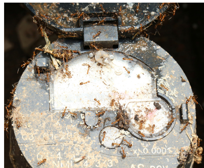
Yellow crazy ants can be found on metres