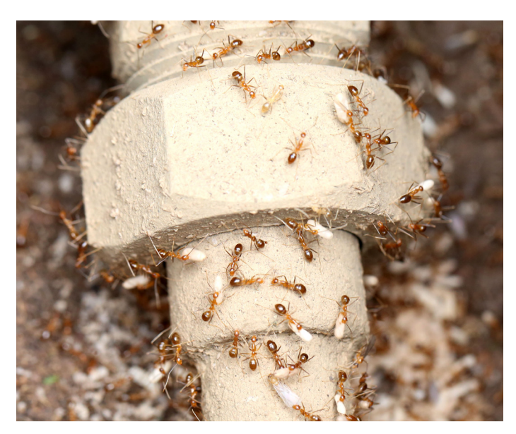
Yellow crazy ants smothering pipe