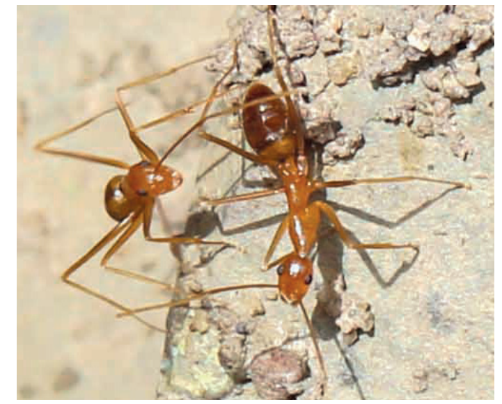
Yellow crazy ants

This fact sheet is developed with funding support from the Land Protection Fund.