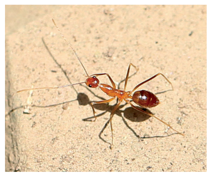
Yellow crazy ant