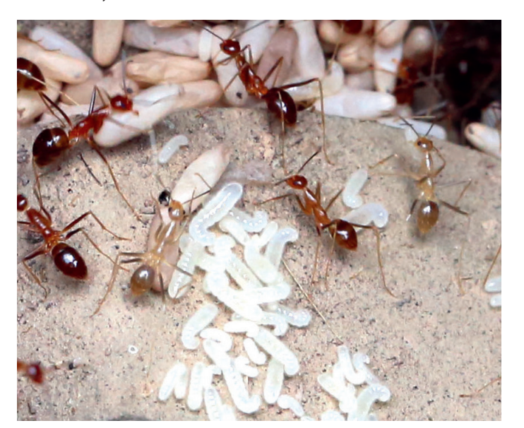
Yellow crazy ants pupa